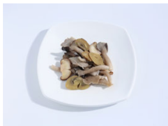
Frozen and dried mushrooms