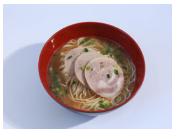
Frozen barbecued pork Specification: 2.8kg/piece Main raw materials: pork