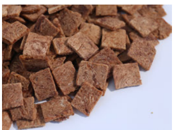
FD beef slices

Specification: single piece 2G Main raw materials: beef