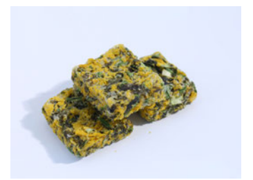
FD seaweed egg soup

Specification: single piece 7g Main raw materials: egg, laver, onion, coriander