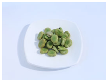
Frozen broad bean