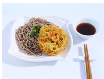
Frozen wild vegetable tempura Specification: 80g / piece Main raw materials: onion, carrot, Komatsu