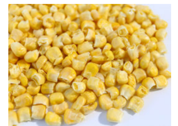
FD corn kernels

Specification: single piece 7g Main ingredients: chicken, shredded black fungus, ginger, green onion, Cordyceps flower, medlar