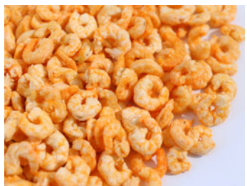
FD shrimp (sesame oil)

Specification: single piece 7g Main raw materials: egg, laver, onion, coriander