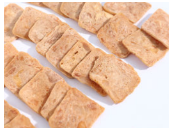
FD barbecued pork slices

Specification: bulk Main raw materials: Asparagus