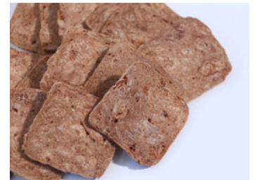
FD beef slices

Specification: single piece 2G Main ingredients: pork, chicken