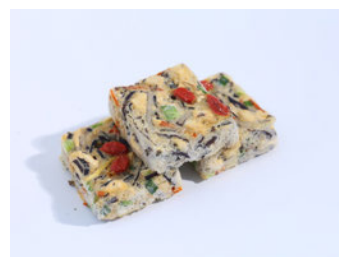
FD Cordyceps wolfberry chicken soup

Specification: bulk Main ingredients: beef, chicken