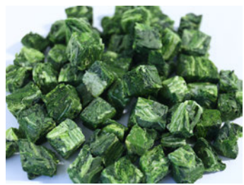
FD spinach granules