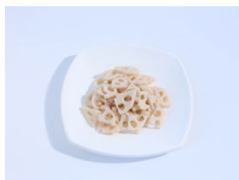
Frozen lotus root slices