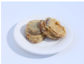
Frozen broad bean Specification: 40g / piece Main ingredients: eggplant, chicken,, pork, soybeans, burdock, carrot, onion