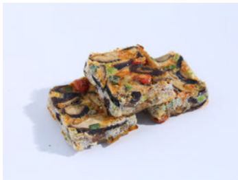
FD mushroom soup

Specification: single piece 7g Main raw materials: Lentinus edodes, Pleurotus ostreatus, Agaricus blazei, mushrooms, onion, medlar