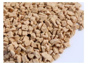
FD pork granules

Specification: single piece 7g Main raw materials: yam, okra, carrot