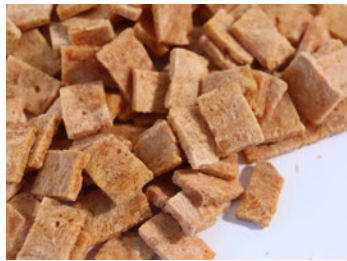
FD pork slices

Specification: bulk Main raw materials: pork