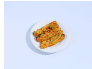
Frozen Mini tempura Specification: 30g / piece Main raw materials: onion, carrot, Komatsu