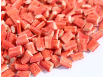
FD crab meat stick