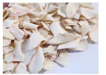
FD squid slices

Specification: single piece 3G Main ingredients: pork, chicken