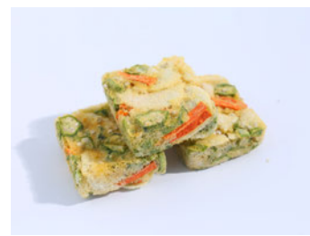
FD okra yam soup

Specification: bulk / single piece 5g Main raw materials: soybean