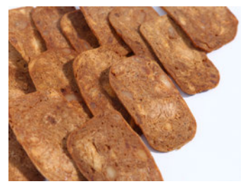
FD square barbecued pork slices

Specification: single piece 3G Main ingredients: pork, chicken