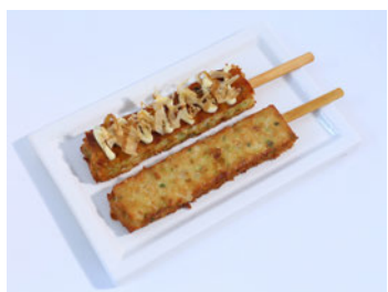
Frozen Osaka Specification: 90g / piece Main raw materials: Korean cabbage, scallion