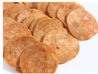
FD round barbecued pork