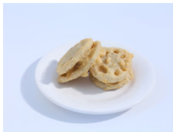
Frozen lotus root meat Specification: 40g / piece Main raw materials: lotus root, chicken,, pork, soybeans, burdock, carrot, onion