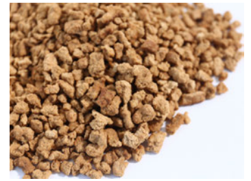
FD beef slices