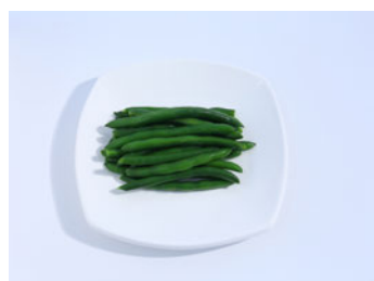
Frozen green beans