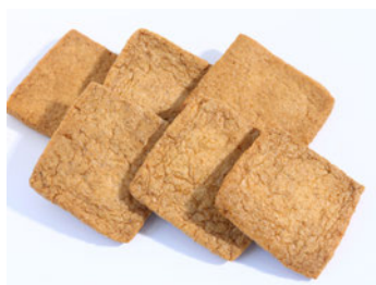
FD oil tofu

Specification: single piece 7g Main raw materials: Lentinus edodes, Pleurotus ostreatus, Agaricus blazei, mushrooms, onion, medlar