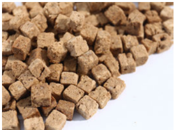
FD angle Diced Pork

Specification: bulk Main raw materials: pork