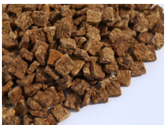
FD braised beef slices

Specification: bulk Main raw materials: beef