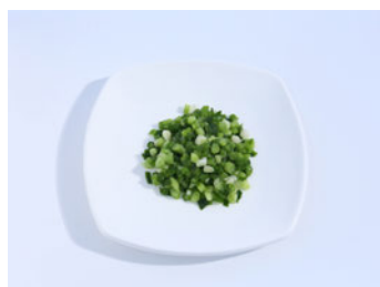
Frozen pearl onion