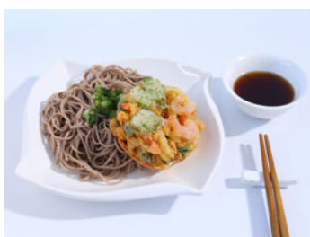
Frozen seafood tempura Specification: 100g / piece Main raw materials: onion, carrot, green knife bean, burdock, sweet potato, squid, shrimp