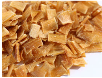
FD dried bamboo shoots